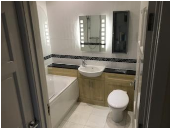
First floor bathroom showing power shower over bath