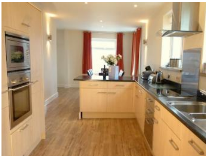
view of kitchen showing sink, oven and work surfaces through to open plan dining room