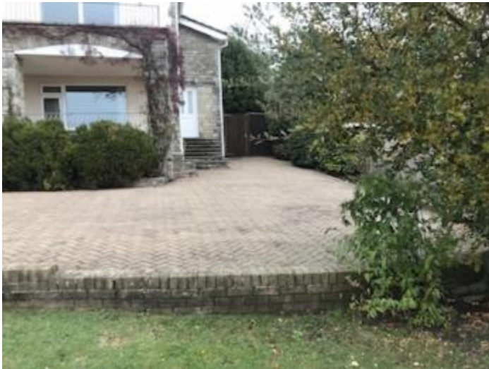
Parking space for four cars outside the front door on block paving