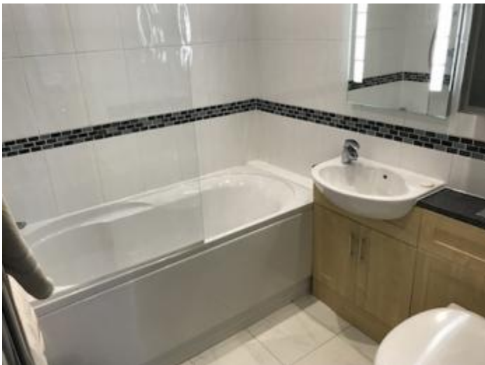
Ground floor bathroom showing power shower over bath