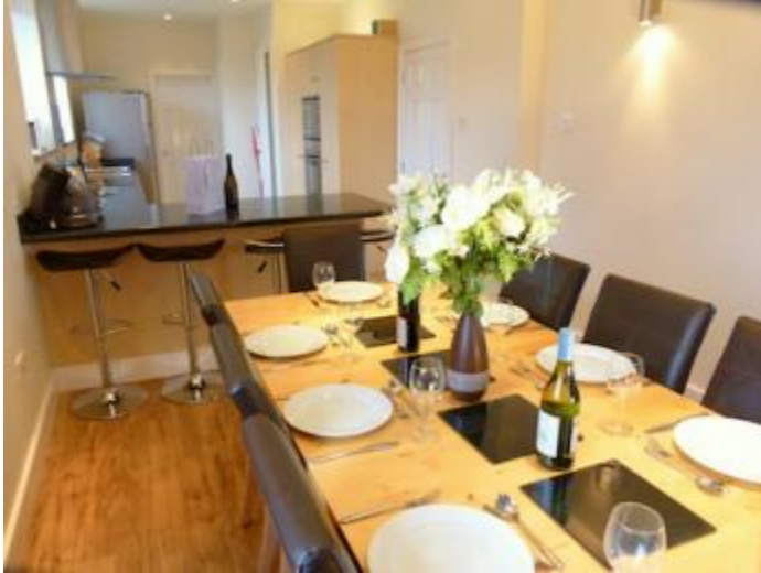
View from dining room to kitchen showing table laid for 10