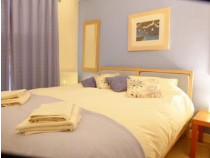
ground floor double bedroom showing kingsize bed