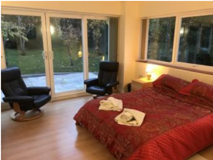
4th bedroom showing double bed, two easy chairs and patio doors