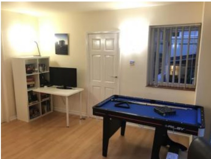
Pool table, TV and games selection in 4th bedroom