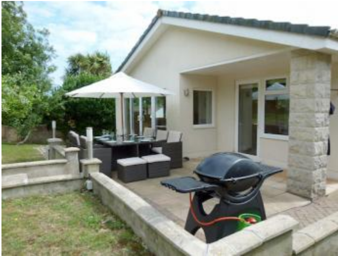
Rear patio with gas barbecue and patio table with 6 chairs and 4 stools

The rear garden has gates which can be closed to prevent toddlers escaping to the front. But please note it is a natural garden with natural hazards for toddlers.