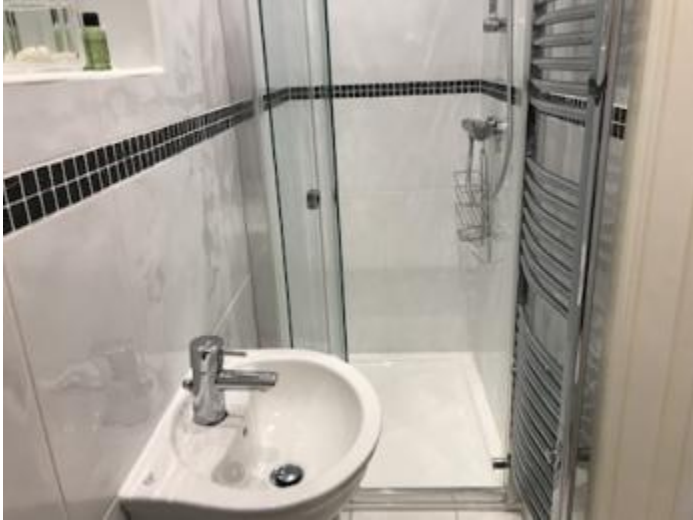
First floor shower room showing shower and distance between basin and radiator