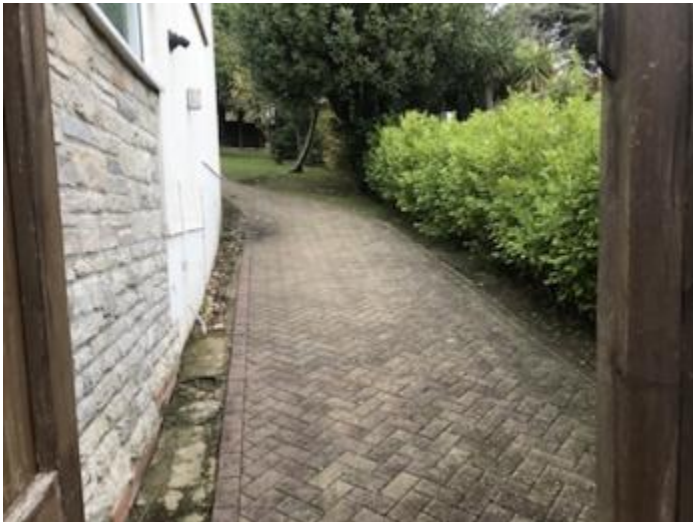
Access to the house back entrance avoiding steps up a slope on block paving