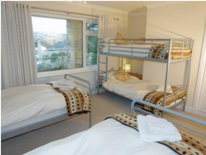
Ground floor quad bedroom with two single beds and one bunk bed suitable for adults