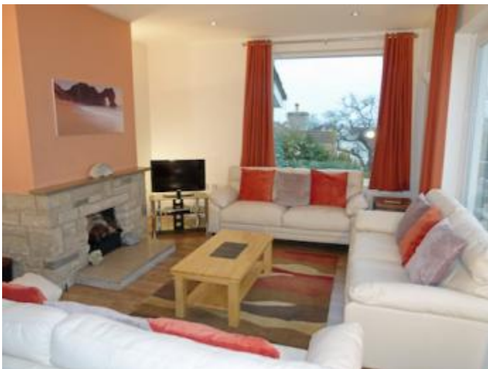
Living room with three 3-seater sofas and coffee tables