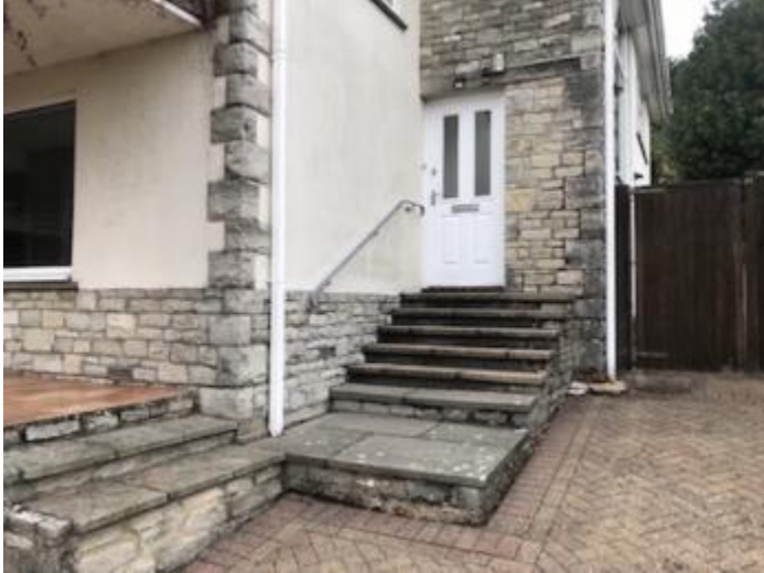
Eight steps leading up to front door with handrail on wall