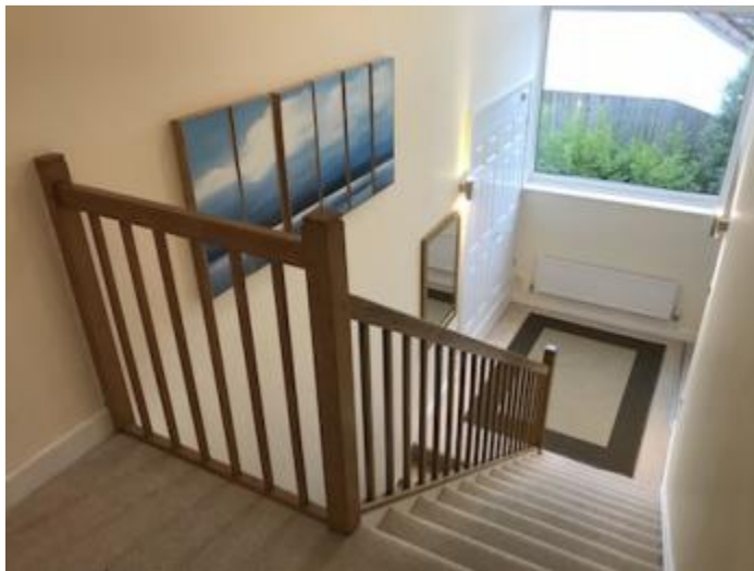
View from first floor showing 12 stairs down to main hallway and further 4 steps to ground floor