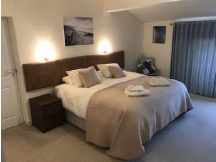
First floor double with super kingsize bed